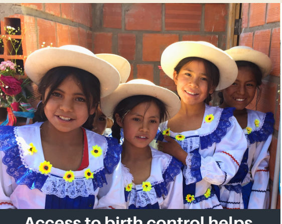
Access to birth control helps keep young women in school